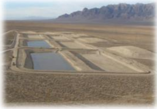
Round Mountain Gold, Rapid Infiltration Basins (RIBs)

https://tools.water.nv.gov/permitinformation.aspx?app=83333 . This permit has a (current) combined diversion rate of ~19,000 gpm, which expands to ~36,000 acre-ft annually (afa). However, the most important permit term is our consumptive use limit of 14,467 afa. Of course, we also have robust monitoring requirements that require regular reporting of our water balance, showing exactly how much water is consumed each month for all manners of use, and we rely heavily on RIBs to manage our net consumptive use. This is typical, and every mining operation that I know of using RIBs like we do, has consumptive and non-consumptive water rights. None of them have only nonconsumptive permits and that’s why AB109 (as written) wouldn’t affect dewatering mines. Plus, AB109 is specific to geothermal. I don’t believe AB109 is going to pass. However, I don’t trust the Environmental NGO behind it and I think they’re using this bill to make a point and start a larger conversation.”